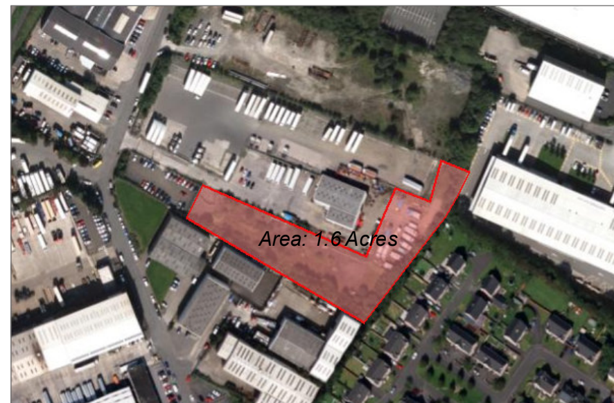
For illustration purposes only.